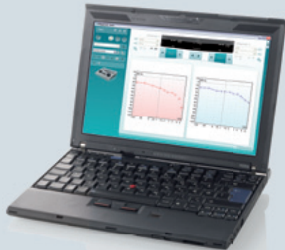
Diagnostic Suite software